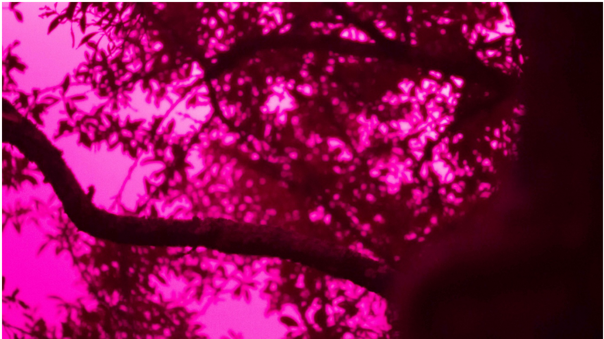
UV Photography of the Katzenwedelwiese, Photo: Stéphane Verlet-Bottéro.

Before enjoying Gado-Gado, Aldizar and Oliver will invite everyone to play with clay. After our playful clay session, we'll sample a honey-tizer – honey being known for its antibacterial properties – and then share a Gado-Gado meal eaten by hand.